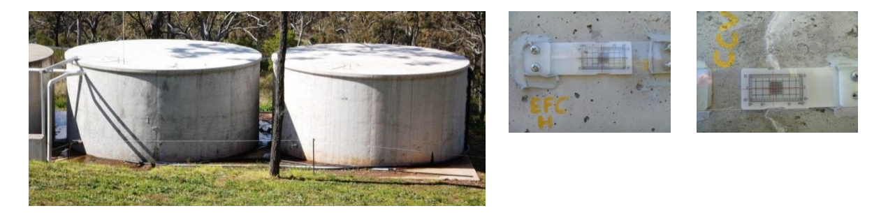
Figure 4 EFC Water Tank

The objectives of the study were firstly to assess the water resistant properties of EFC and secondly to investigate the autogenous crack healing behaviour of this geopolymer concrete. Autogenous healing in Portland cement based concrete is primarily due to the deposition of calcium hydroxide. As there is no calcium hydroxide present in EFC, the performance of it in a water retaining application is of considerable interest. Nominal leaking through cracks in the EFC tank did heal relatively rapidly. Ahn and Kishi (4) discuss a re-crystallization mechanism occurring in geo-materials which may be the mechanism responsible for the crack healing noted above.