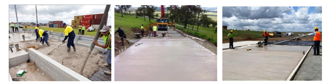
Figure 1 EFC hand placed pavements

Placement of thin EFC slabs on ground is somewhat more difficult and labour intensive than traditional concrete due to its higher internal cohesion coupled with a propensity for rapid surface drying. The development of purpose designed admixtures and refinement of the chemical activators has produced an EFC pavement mix with a modified rheology more suited to thin slab construction. Development work continues in this area, however currently EFC can be produced as a suitable thin slab pavement mix with some modifications in the placement techniques, figure 1.