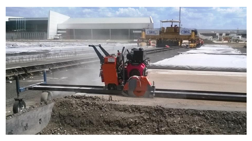
Saw suspended on bridge to allow earlier joint formation