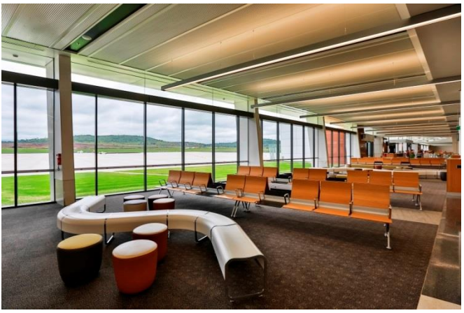
Figure 13. Operational BWWA.