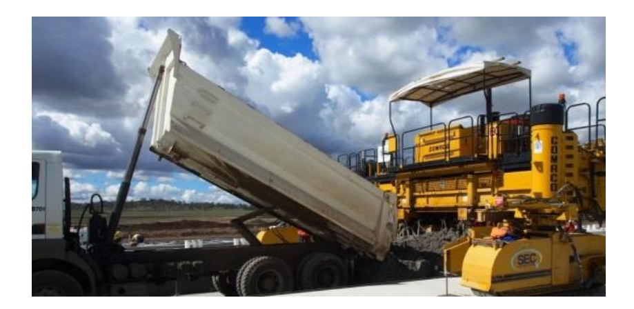
Figure 10. EFC delivery to slip form paver.