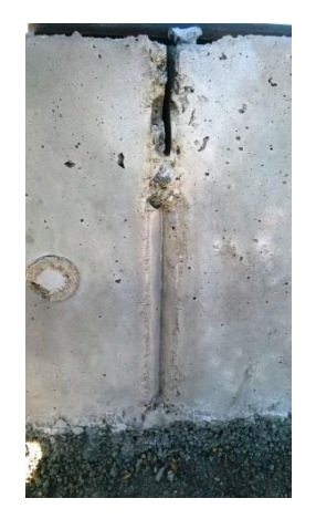
Fine crack in saw cut joint

The geopolymer concrete's lower shrinkage properties compared with conventional concrete would indicate that joint spacing could be increased over those used for conventional concrete. Wagners' test data on EFC indicated an average 56 day drying shrinkage of 350 microstrain, tested to AS 1012.13 (9). A significant benefit and cost saving on future work would be to increase the spacing of joints based on the higher flexural strength and lower shrinkage properties of EFC.