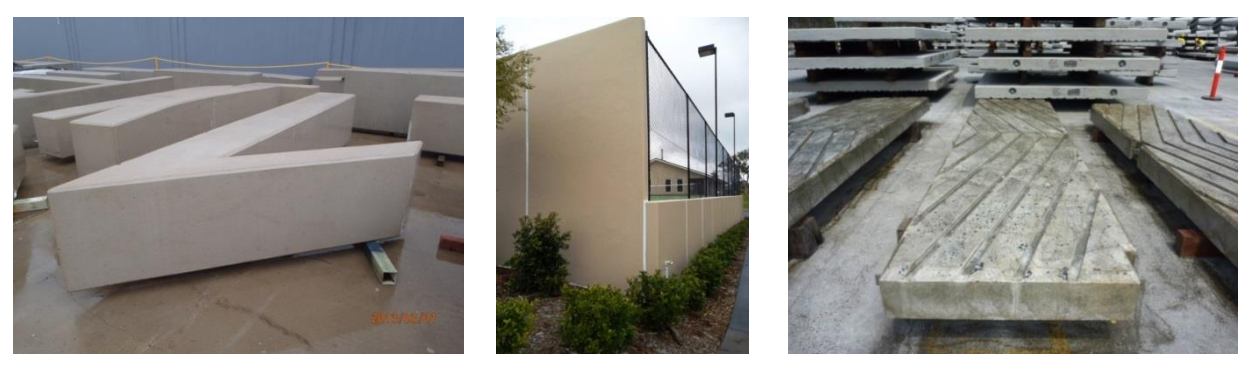
Figure 2 EFC precast