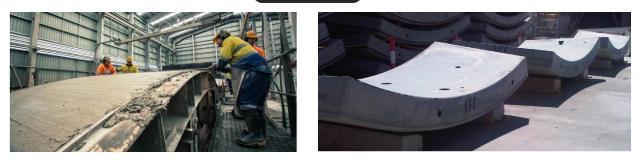
EFC segments produced in a carousel factory, Brisbane Australia