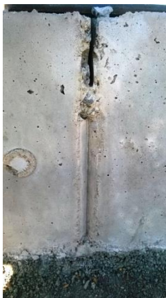
Fine crack in saw cut joint

The geopolymer concrete's lower shrinkage properties compared with conventional concrete would indicate that joint spacing could be increased compared with conventional concrete. However, this option was not pursued in order to maintain a low risk for this application of an innovative material. The supplier's test data on this geopolymer concrete indicated an average 56 day drying shrinkage of 350 microstrain, tested to AS 1012.13 (2). A significant benefit and cost saving on future work would be to increase the joint spacing based on the higher flexural strength and lower shrinkage properties of this geopolymer concrete.