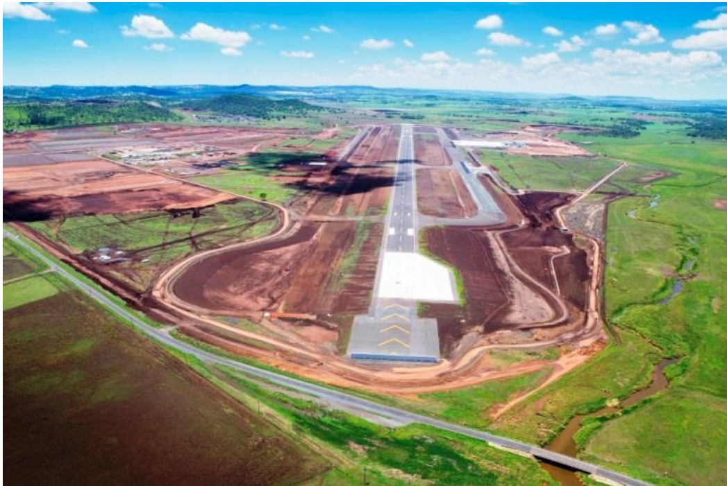
Figure 1. Site plan and aerial photograph – BWWA.

Following a successful trial phase, the geopolymer concrete mix and pavement construction method was approved by the engineers. Construction of the turning node pavements was undertaken during August and September 2014 and the apron pavements were constructed during October and early November 2014. BWWA was opened for its first commercial flight on 17 November 2014.