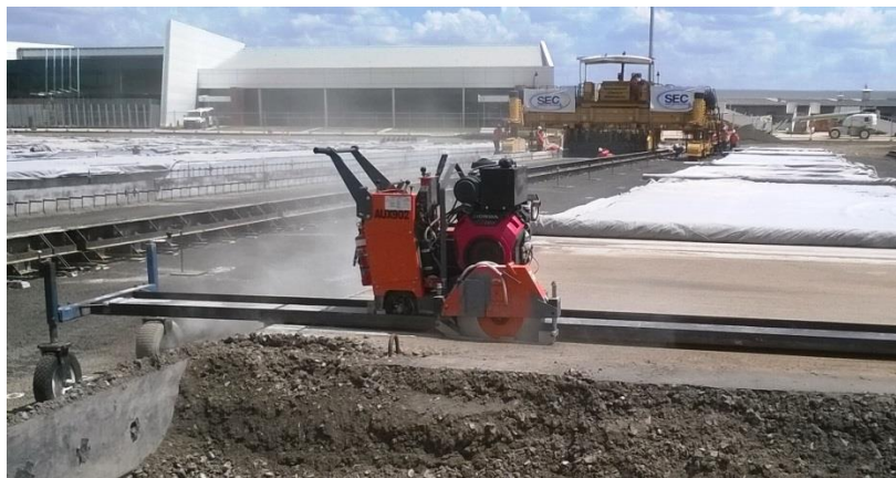
saw suspended on bridge to allow earlier joint formation