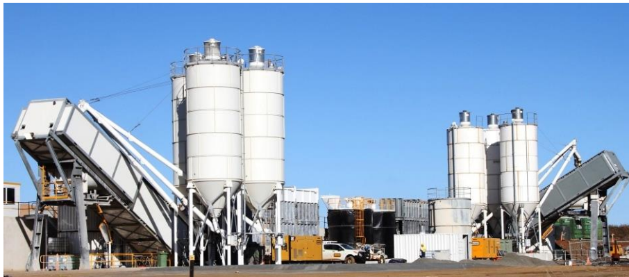
Figure 3. Geopolymer concrete twin batch plant.

A maximum supply capacity of 120 m 3 /hr was required to provide a continuous feed of concrete to the slip form paving machine which is shown in Figure 4. This requirement was successfully achieved using the plant configuration and several tipper trucks for delivery. An advantage of wet mix production is that concrete agitator trucks are not required for short transit times. The use of tippers allowed a significantly improved discharge rate at the paver face.