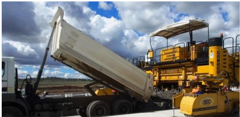
Figure 4. Geopolymer concrete delivery to slip form paver.