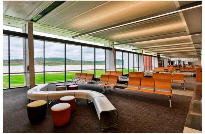
Figure 8. Operational BWWA.