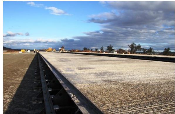
Figure 6. Curing and side forms with dowels.

Jointing design of the pavements followed conventional rules based on Portland cement concrete. In the direction of paving, joints were saw cut at 5 metres centres with isolation joints provided every 70 metres. Early age saw cutting was carried out as soon as possible, generally 1 to 5 hours after placement depending on the ambient temperatures as shown in Figure 7. Dowels were located between paving lanes as shown in Figure 6.