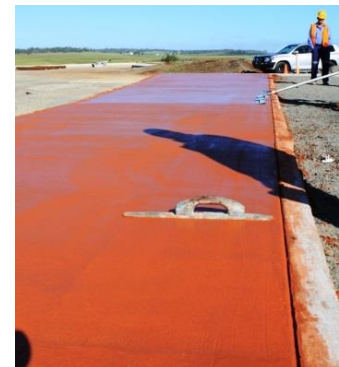
Figure 9. Other Geopolymer Concrete Works at BWWA.